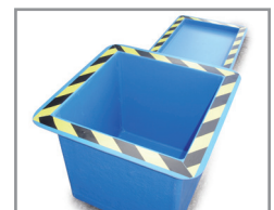
Custom Built Bunds

Tailor made to your exact requirements, our one piece moulded custom built bunds are more economical than you might think.