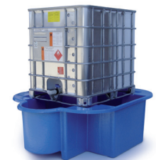
IBC Bunds and Spill Pallets

This is suitable for 1000-1500 litre IBC units for use across all industrial sectors. It can support one or two IBC units and special facilities can be added.