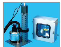
Bund Water Control Unit

Developed to remove rainwater from banded areas designed to contain oil. Once water is detected it automatically activates a submersible pump to remove only the unwanted clean water.