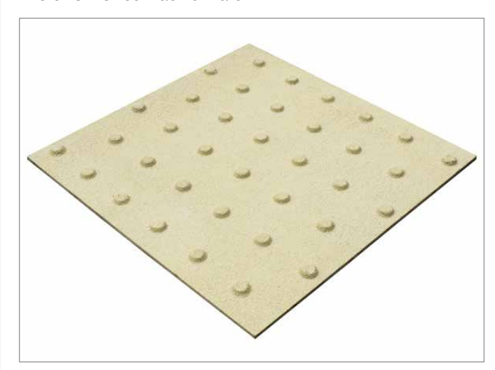
Blister Off-Street Tactile Plate.

For prices, a free sample or to buy online visit: www.SafeTread.co.uk or call 01206 227 660 to speak to our specialist team.