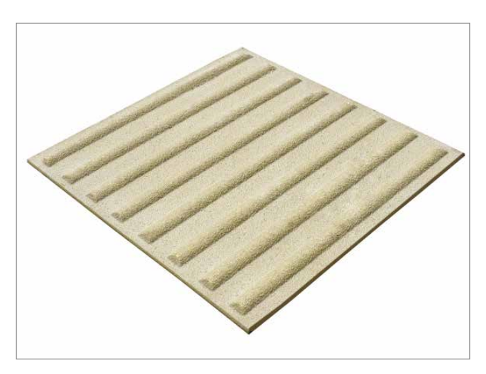
Corduroy Tactile Plate.

A fitting service available if required.