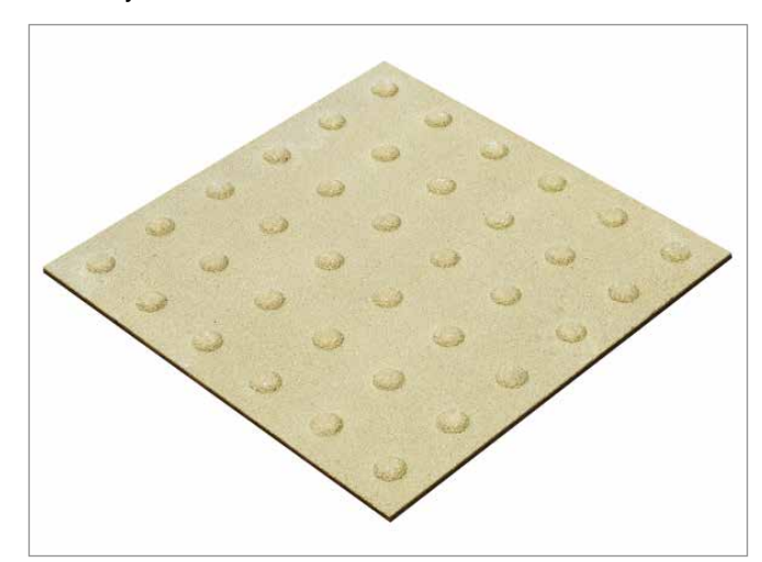
Blister On-Street Tactile Plate.