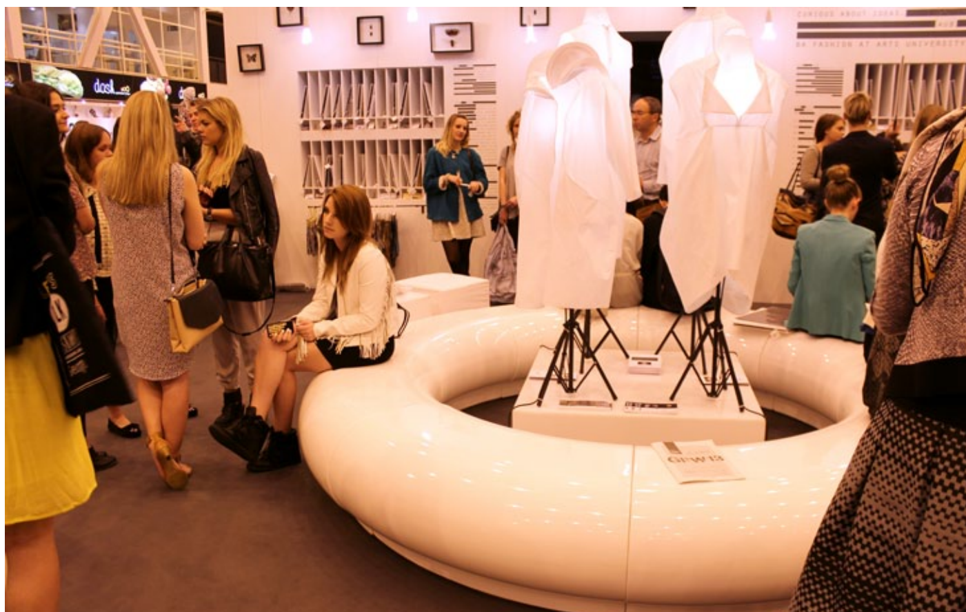
Halo Modular Seating

Hilary Collins, Big Wave PR, Tel: 01206 231807, email: Hilary@bigwavepr.co.uk