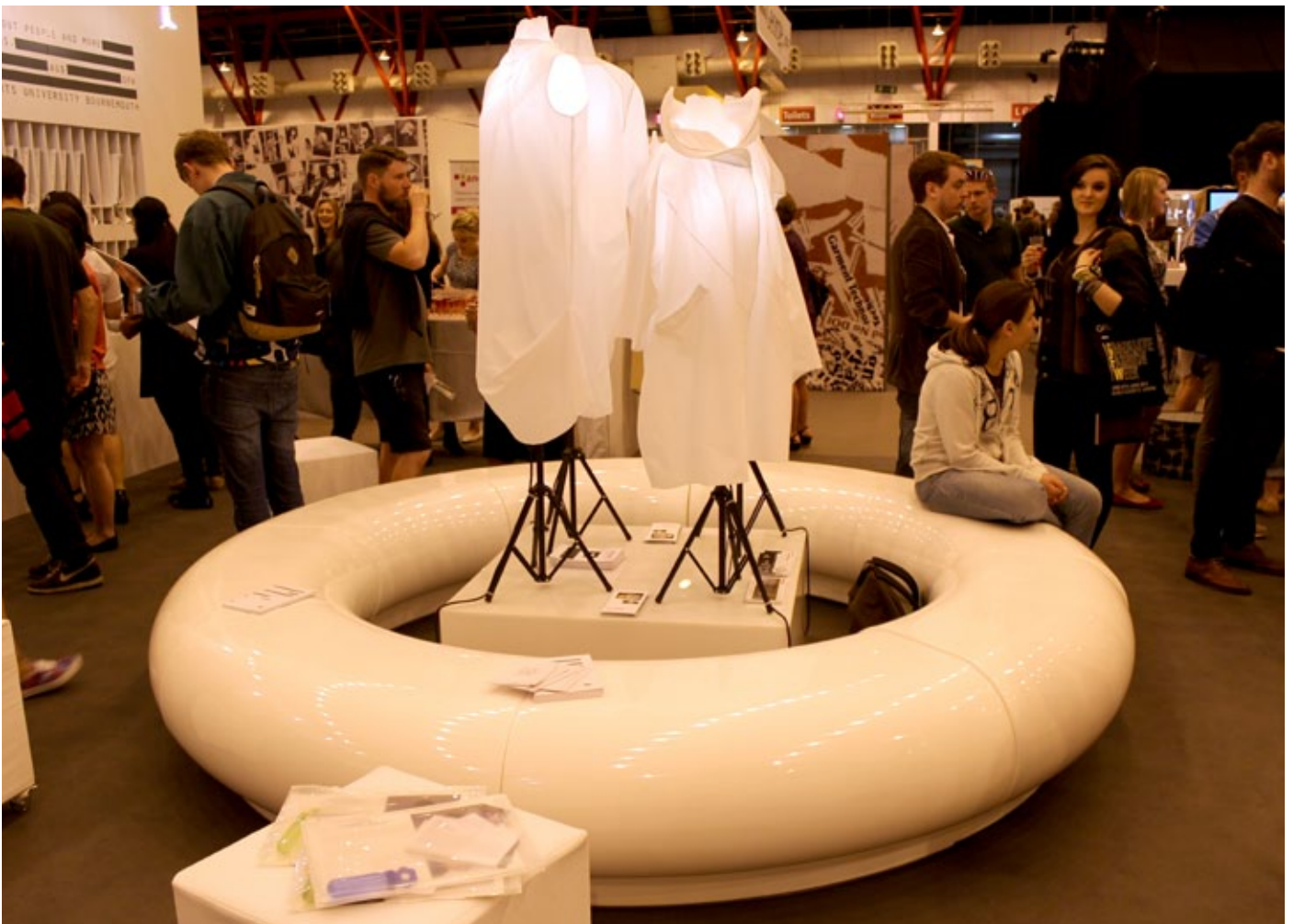
Halo Modular Seating