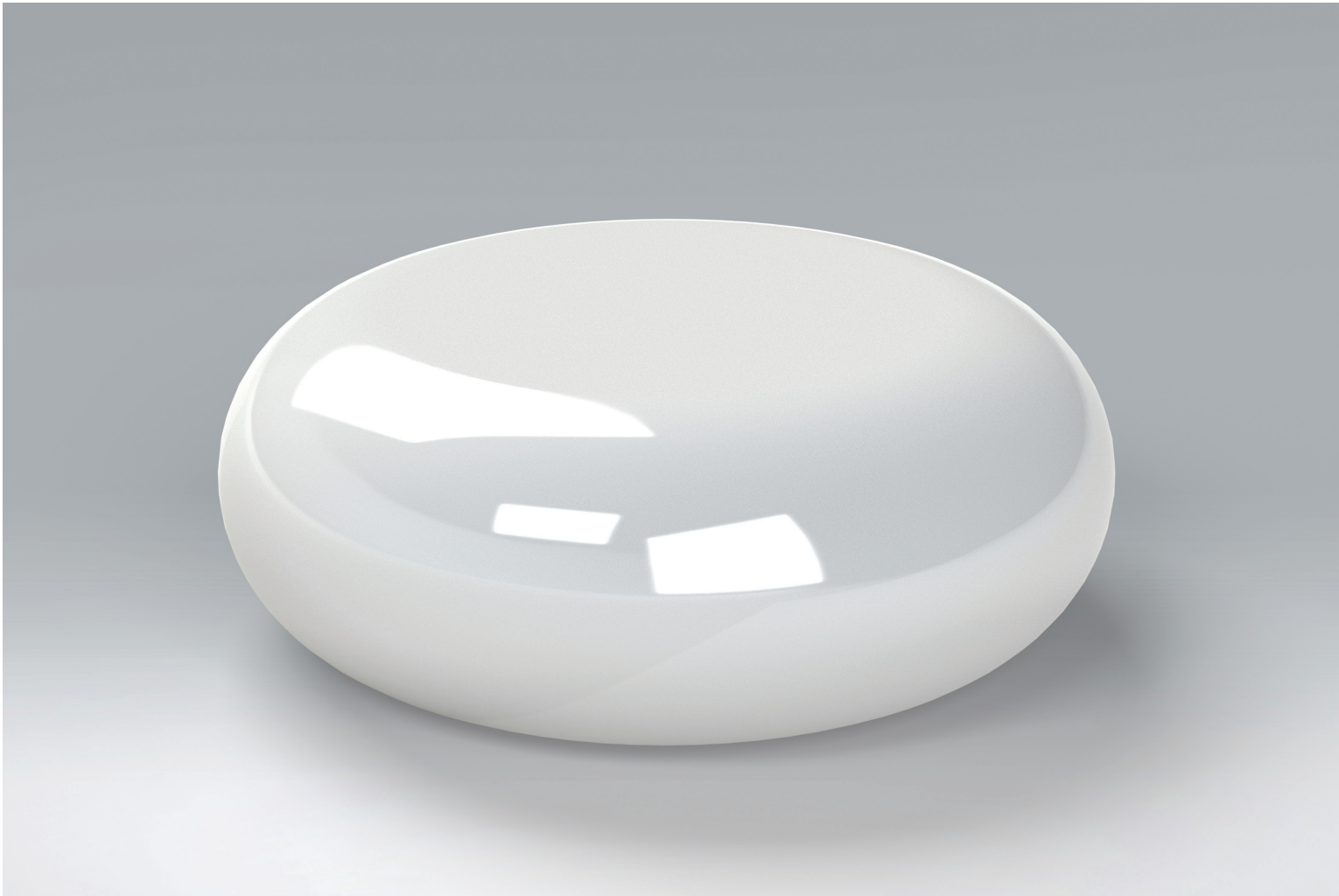
Ultra-contemporary seating for colleges, libraries, retail outlets and airports.